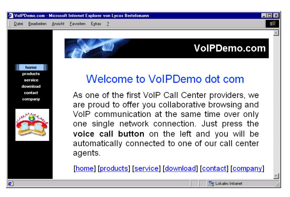
Fig. 2. HTML page with voice call button

the applet starts the telephony software with the customer's IP address through a system call, which is checked by the security manager.